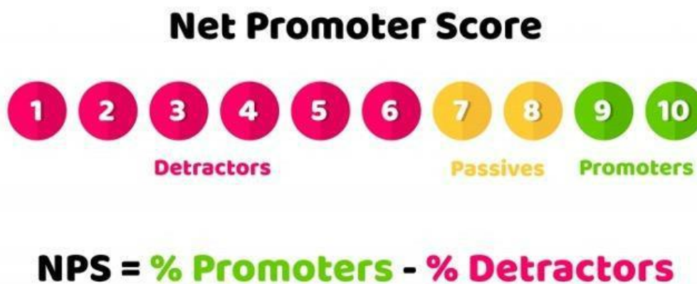
Figure 1. Net Promoter Score formula by Fred Reicher.

may maintain their loyalty to the brand, or they have the potential to switch to competitors if they want to. Therefore, they will not try to refer a potential customer. The last is detractors, usually dissatisfied consumers, who might harm your brand and restrict growth through negative WOM (Hamilton, 2007). NPS is determined by the disparity of promoters and detractors in percentage, as shown in the formula in Figure 1.