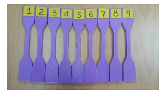
Fig. 2 Fabricated sample of PLA materials

The fabricated specimen's shape is certainly uniform to make