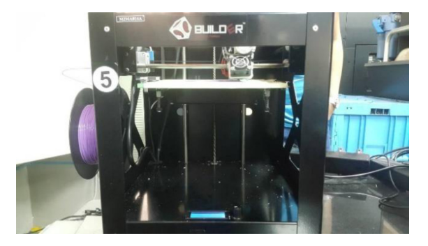
Fig. 1 Builder M2MA014A 3D printer