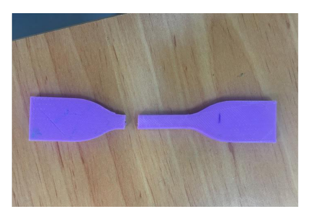
Fig. 3 Specimens after tensile test

optimal range of all factors, which are lower limit, upper limit and mean, to guarantee the success in printing the specimens. Table 4 indicates the levels of the noise factor of conditioning temperature. In the second day of testing, the lab turned off the air conditioner, which might affect the result of tensile testing machine. Table 5 shows the combination of these parameters in each experiment of the L9 array. The selected sets of parameters were carried out by using defining function for Taguchi approach in Minitab software. For each set of parameters, 2 consecutive trials were tested, and the